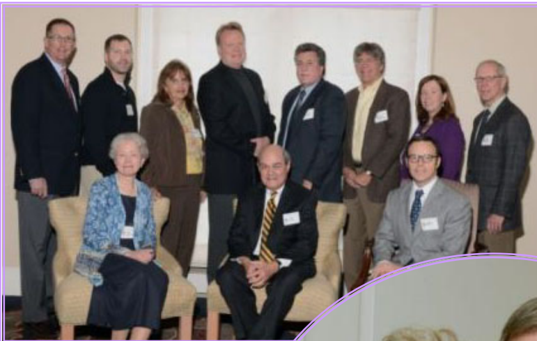
Historical Society Board of Trustees, 2015-2016