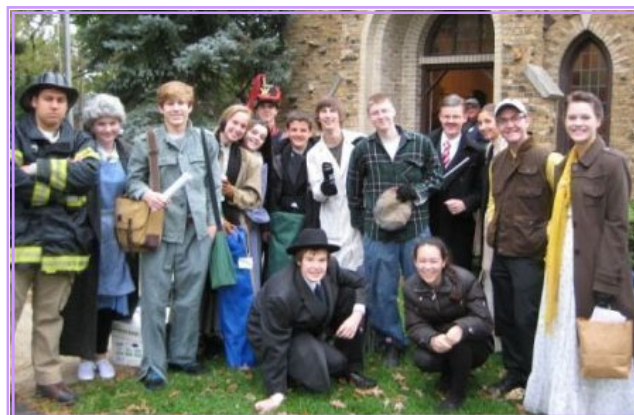
The Maine South cast, Spirits of Old Park Ridge

SAVE THE DATE: The 2015 “Spirits of Old Park Ridge” tour will be held on Saturday, September 26. Visit www.pennyville.org for up-to-date information on this popular event.