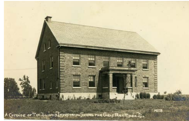
Noyes Cottage (Now Demolished)