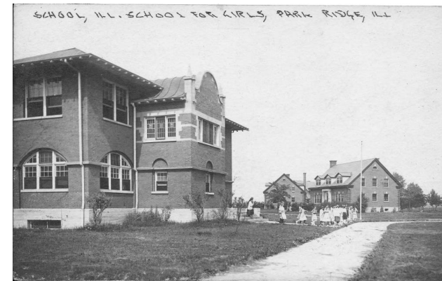
View of Buck Hall (Now Demolished) with Talcott (Now Demolished) and Emery Cottages