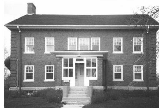
Patten Cottage (Now Demolished)

In 1914, looking across the open and circular school campus, one would have seen the four other residential Cottages built for the young girls: Talcott, Illinois, Noyes and Patten.