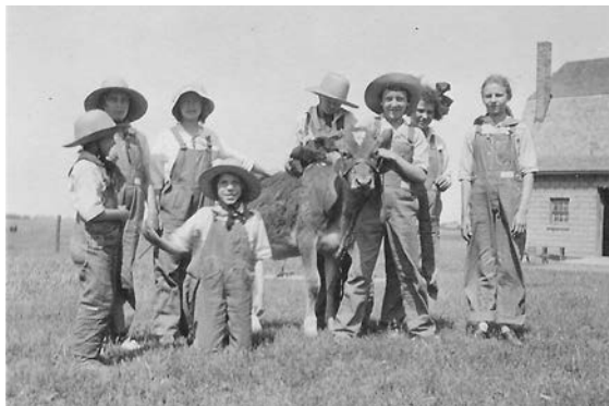
In front of the Barn