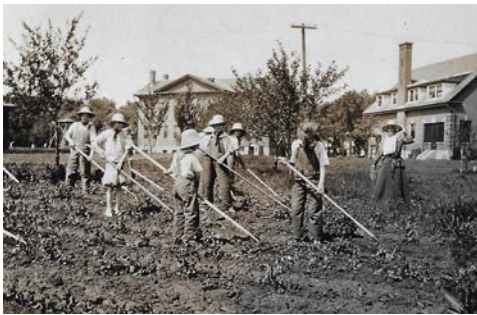
School Kids Working in the Fields