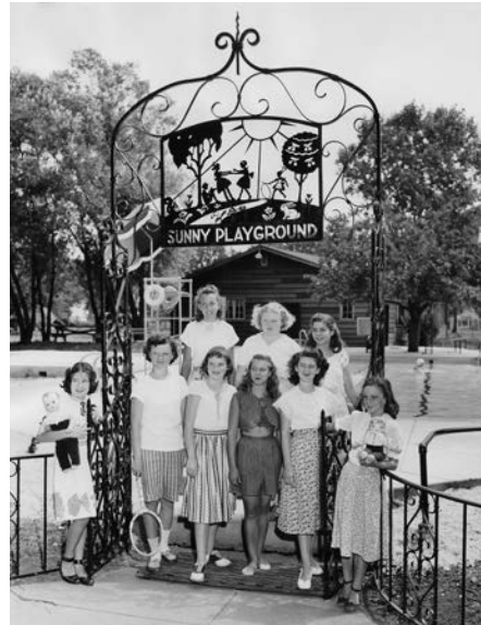
Sunny Playground Arch